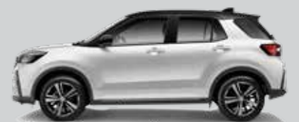
Pearl Diamond White**