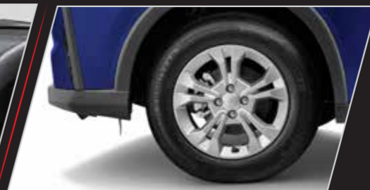
16-inch Alloy Wheels (5-spoke)