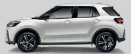
Pearl Diamond White**