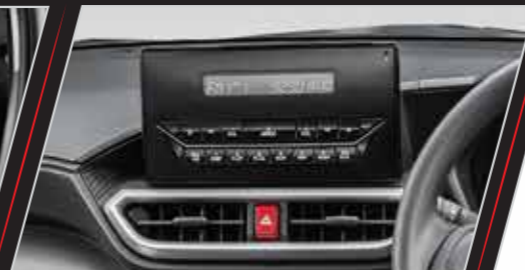
11" Radio with Bluetooth & MP3