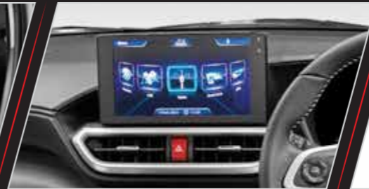
9" Display with sleek user interface