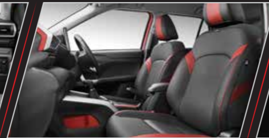
Semi-bucket Leather Seats