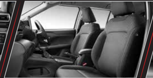
Semi-bucket Fabric Seats