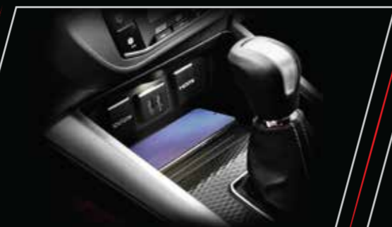
Open Tray with Illumination