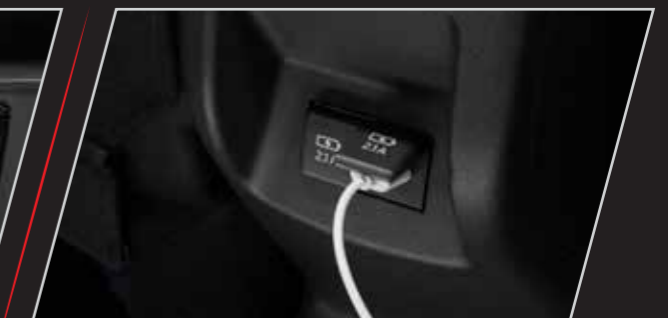
Rear USB ports*