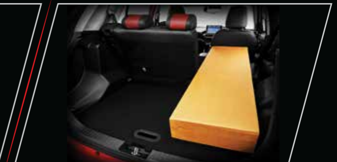
60:40 Split-folding Rear Seats