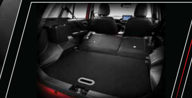
Full-flat Mode Rear Seats