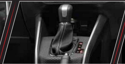
Gear Knob with Chrome