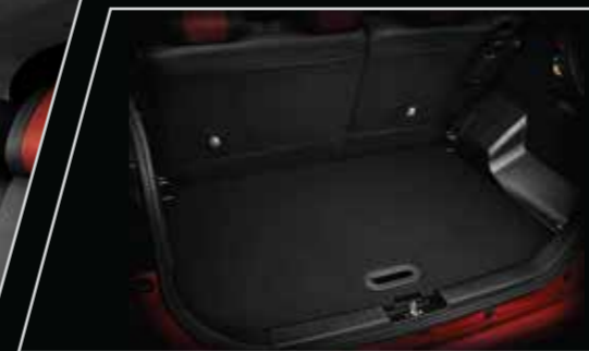
Tier 1: 303 litres