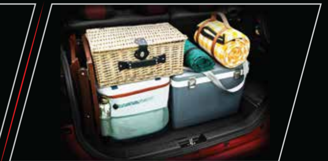
Tier 2: 369 litres