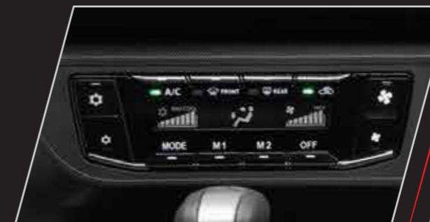
Digital air conditioner controller with quick OFF button