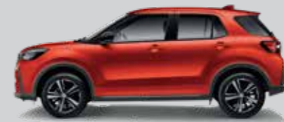
Pearl Delima Red**