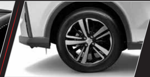
17-inch Alloy Wheels (5-spoke)