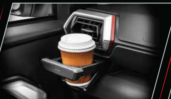
Built-in Cup Holder