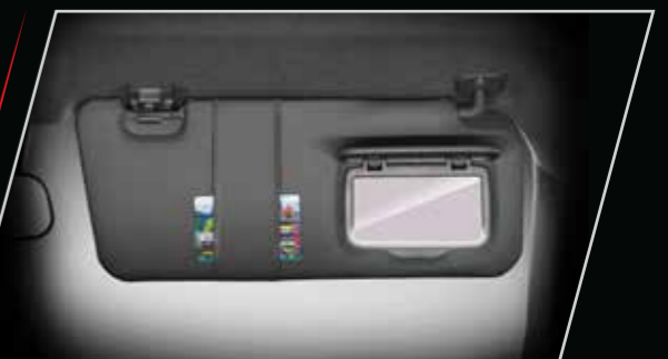
Vanity Mirror with Card Slot