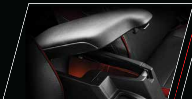
Console Box with Padded Armrest*