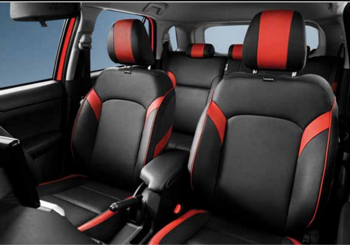
Spacious Interior for comfortable ride

Ergonomically designed to accommodate diverse requirements and needs.