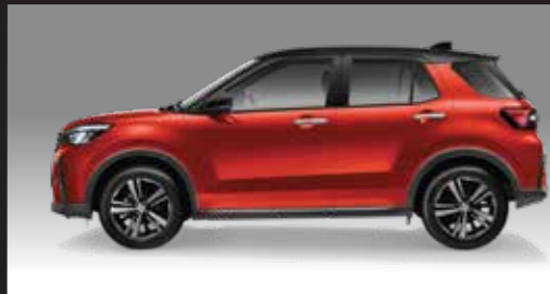
Differences from H