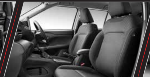
Semi-bucket Fabric Seats