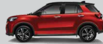
Pearl Delima Red**