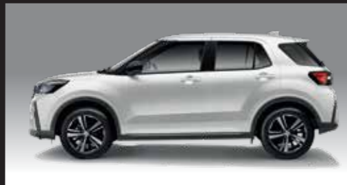
Differences from X